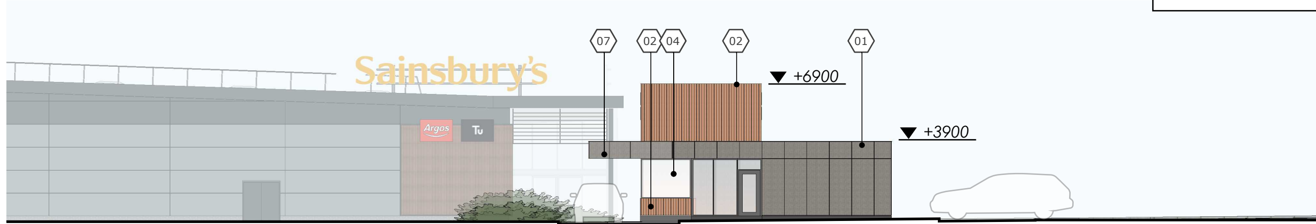
NORTH ELEVATION 1:200 @ A1

© Whittam Cox Architects - Disclaimer: This drawing is copyright of WCEC Group Ltd trading as Whittam Cox Architects, and shall not be reproduced nor used for any other purpose without the written permission of the Architects. This drawing must be read in conjunction with all other related drawings and documentation. It is the contractor's responsibility to ensure full compliance with the Building Regulations. Do not scale from this drawing, use figured dimensions only. It is the contractor's responsibility to check and verify all dimensions on site. Any discrepancies to be reported immediately. IF IN DOUBT ASK. Materials not in conformity with relevant British or European Standards/Codes of practice or materials known to be deleterious to health & safety must not be used or specified on this project.